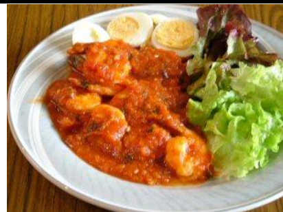
Recipes from Mauritius