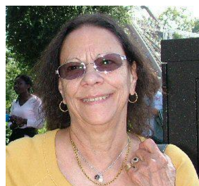
Recipes by Madeleine Philippe

Wash the cumquats of all dirt and other impurities. Drain. Remove stems from the cumquats. Place cumquats in bottle. Layer with the palm sugar. Fill bottle with white rum. Place bottle on shelf and allow to mature for three months or longer. Enjoy in small doses. You can also offer the rum soaked cumquats to your friends. These will just explode in their mouths. Enjoy.