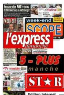
Newspapers from Mauritius