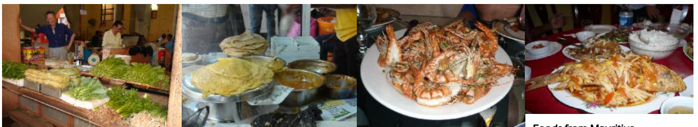
Foods from Mauritius Visit http://ile-maurice.tripod.com

For the horse racing enthusiasts, you can get the latemail for Melbourne & Sydney Racing at http://www.cj.net/melb.htm