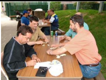
Clubs & Associations