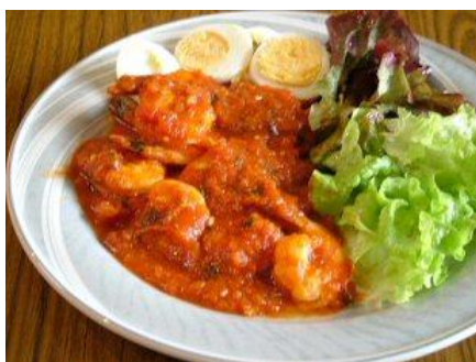
Recipes from Mauritius