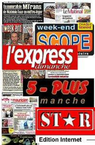
Newspapers & Radio