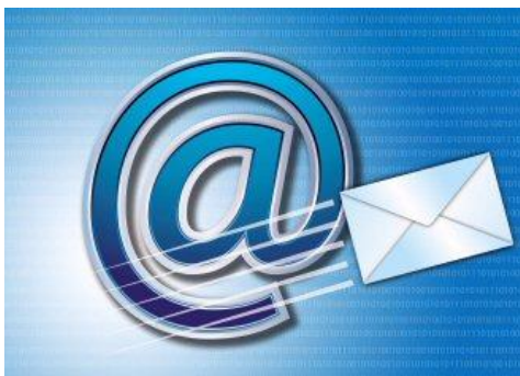
Mailing Lists and Blogs