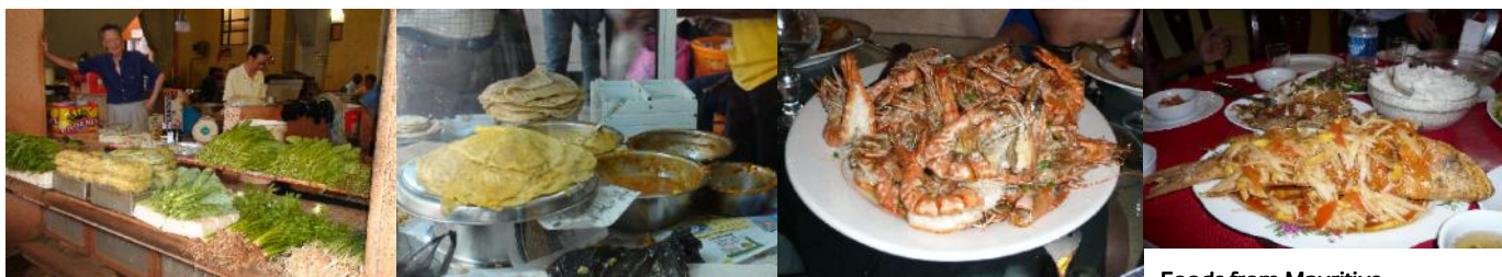
Foods from Mauritius Visit http://ile-maurice.tripod.com

For the horse racing enthusiasts, you can get the latemail for Melbourne & Sydney Racing at http://www.cj.net/melb.htm