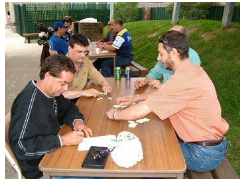
Clubs and Associations